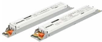
HF-S 118, 136 & 158 TL-D II, HF-S 3/414, 3/424 TL5 II