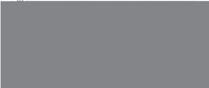
MASTERCcolour CDM-TC 35W /842