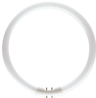
22 W 2GX13 C-T5 16 mm