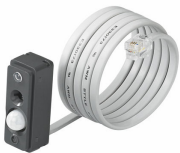
LR11663/00 ActiLume gen2 Multi-Sensor