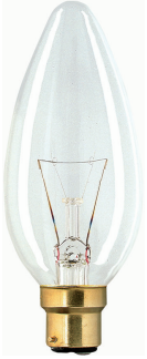
B22 B 35mm Clear