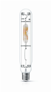
HPI-T, 1000W, E40